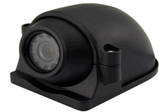
Optional Left Side