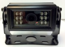
5 th Wheel Camera